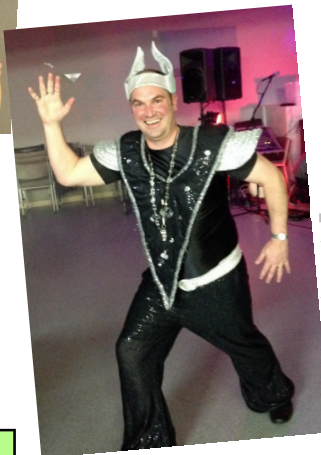
“Disco Nige” gets the party going !!