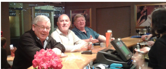
What's Christmas without the three wise men?

Daltons Function Centre in Matamata was the venue for our annual mid-Winter Christmas gathering, although the timing was stretched through to the Spring this year.