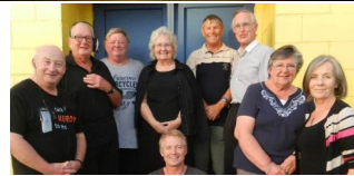
There's no show without the crew !